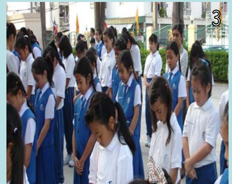
(1) Grade 6 students learn gardening during their Thai career subject. (2) Volunteer students instruct and guide their fellow students to put their plates and utensils in proper places after having their lunch. (3) Some portion of the IBS students during the morning meditation and prayer.