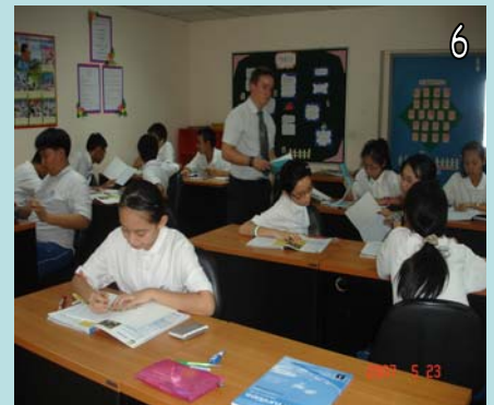
(4) Grade 2 and 6 students are brave enough to read news and articles during the English Morning Programme. (5) High school students intently listen during the brief orientation on leadership. (6) Grade 9 students work as a group during their English class.