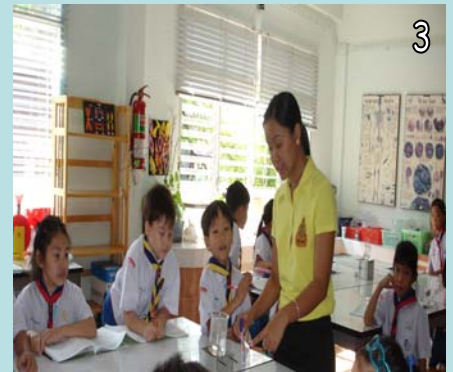
(1) SIP G2A students proudly show their certificates for the House Competition Behaviour and Conduct Awards. (2) IBS2 musicians render musical presentation as part of morning activity. (3) G1 students intently observe and give conclusion during their Science class.