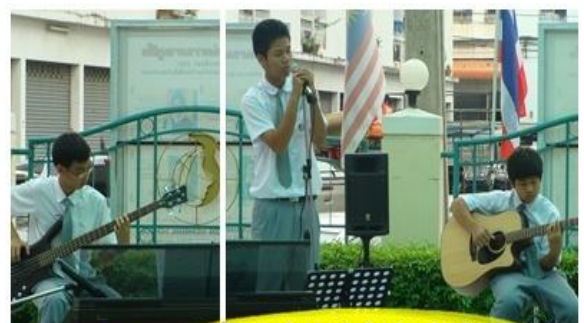
Secondary students singing 'ONE FRIEND'